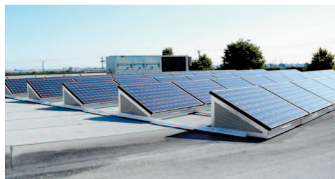
Photovoltaic solar panels, like these shown on the roof of CSA International headquarters in Toronto, will be tested at the CSA International Vancouver lab beginning early in 2009.

For more information, please visit www.getsolarcertified.com .